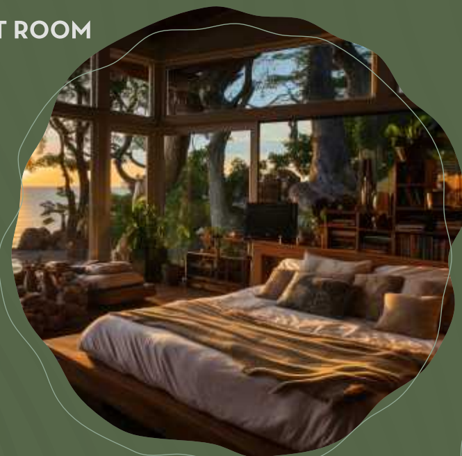
● GUEST ROOM