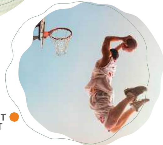
HALF BASKET BALL COURT