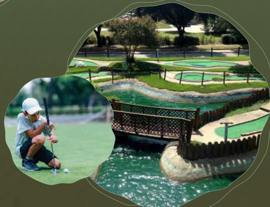
● MINI GOLF