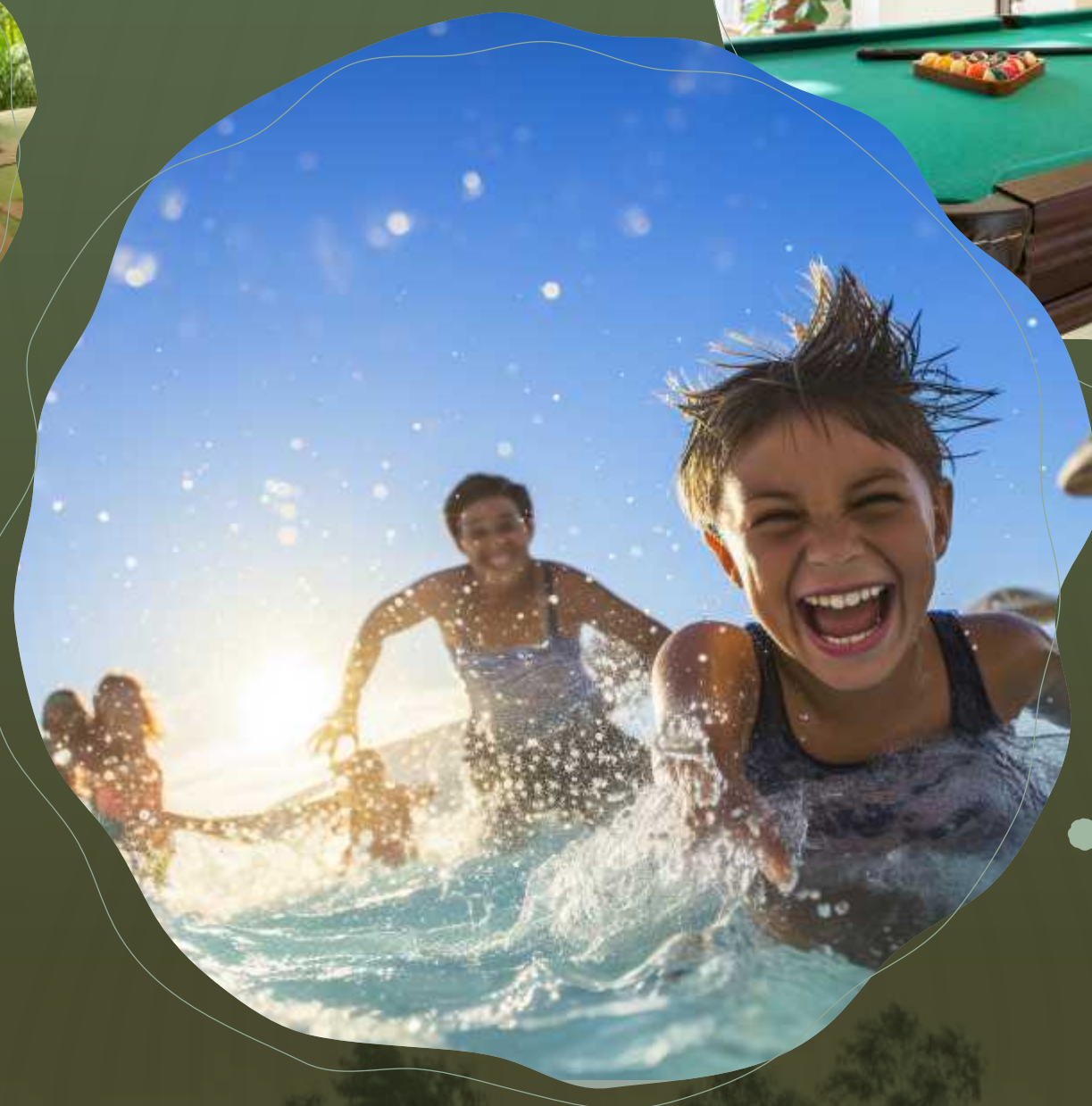
● SWIMMING POOL