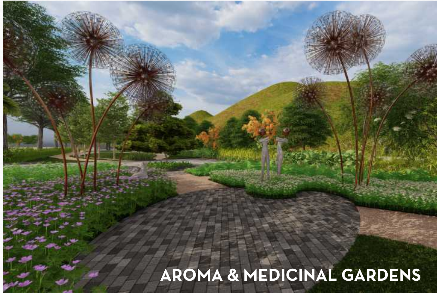
AROMA & MEDICINAL GARDENS