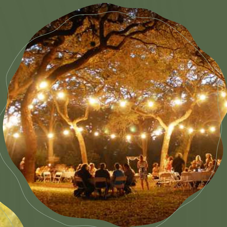
● PARTY LAWNS