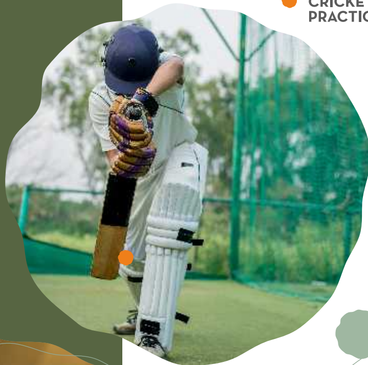
CRICKET PRACTICE NETS