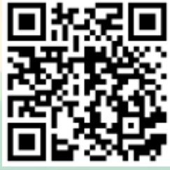
LOCATION QR CODE