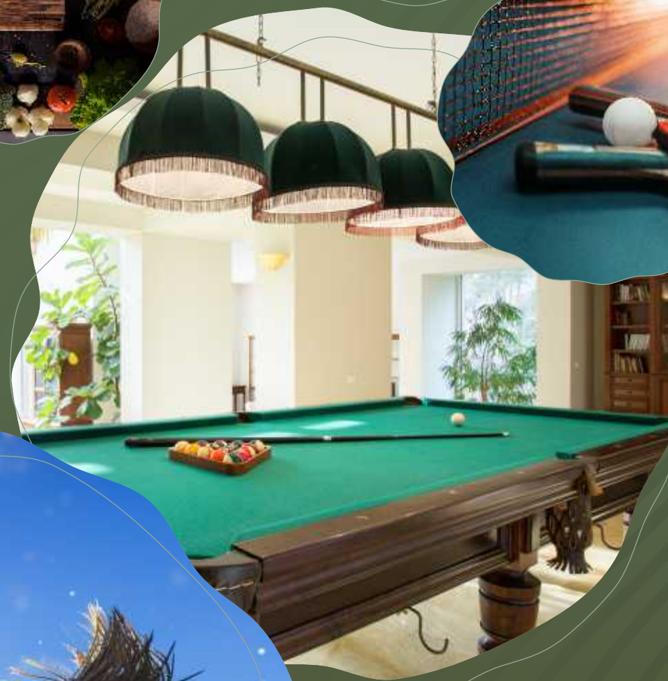
● INDOOR GAMES